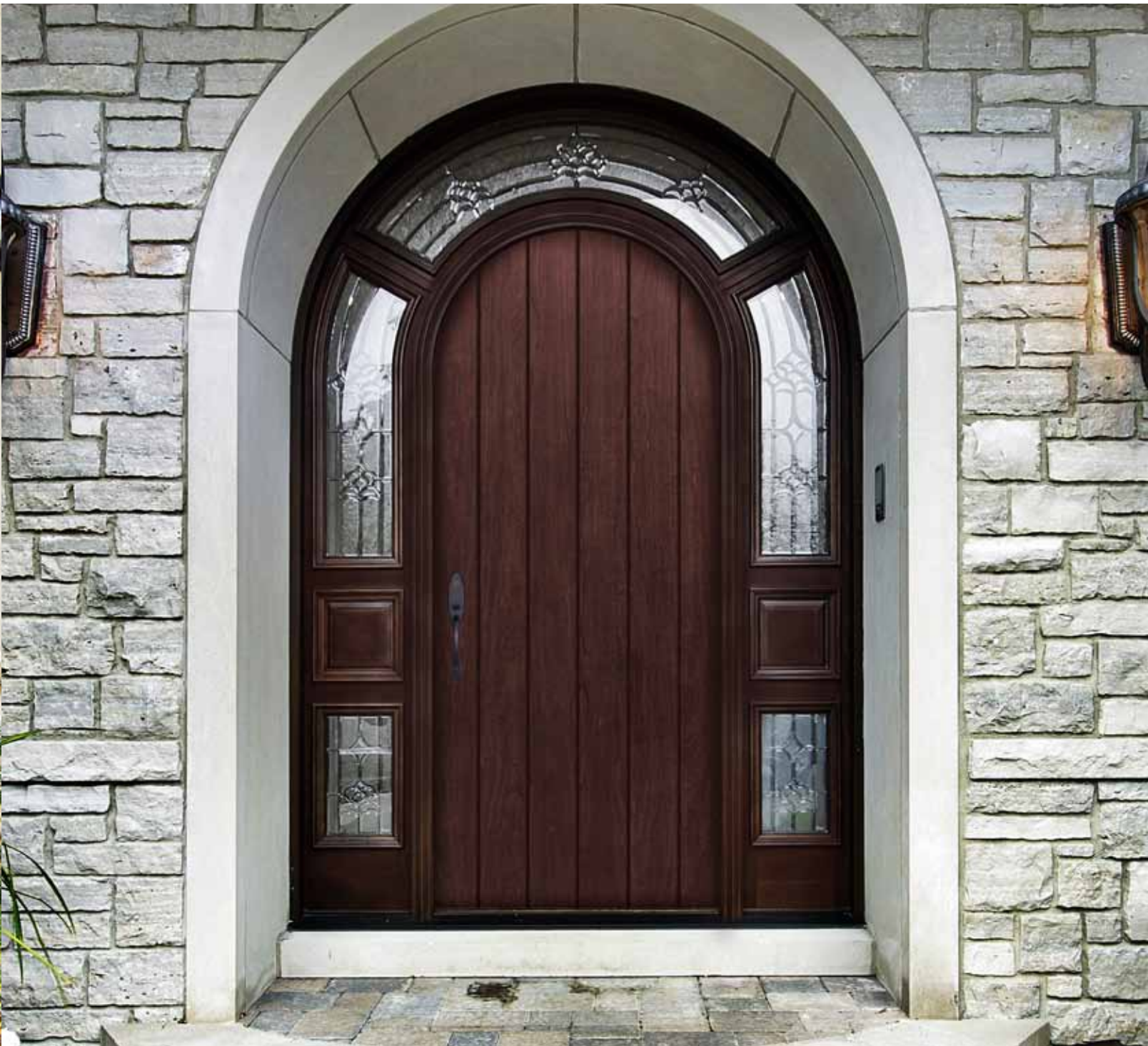
Rustic Cherry Round Top Wide Plank Entry Door