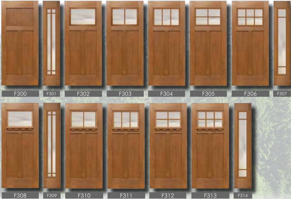
Craftsman Fir Grain