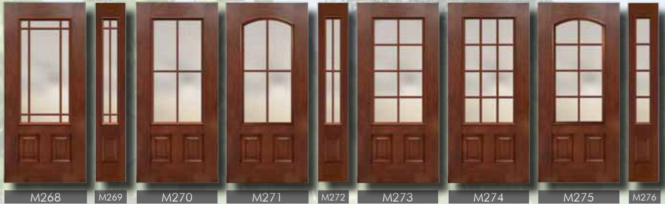
Traditional Mahogany 3 Panel Entry System