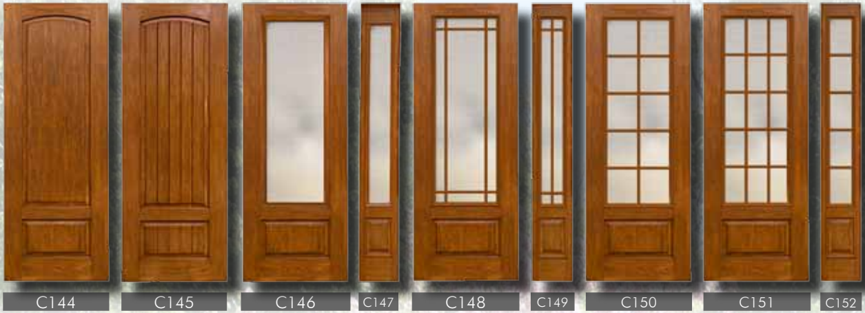
Rustic Cherry 3/4 Entry System