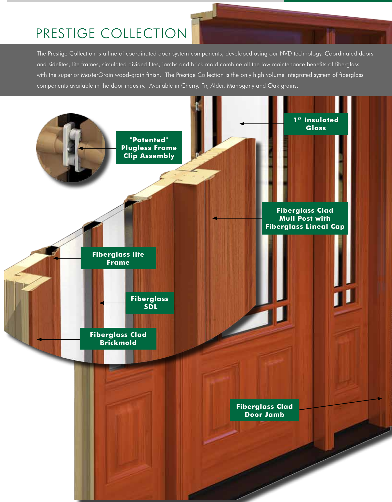
Fiberglass Clad Door Jamb