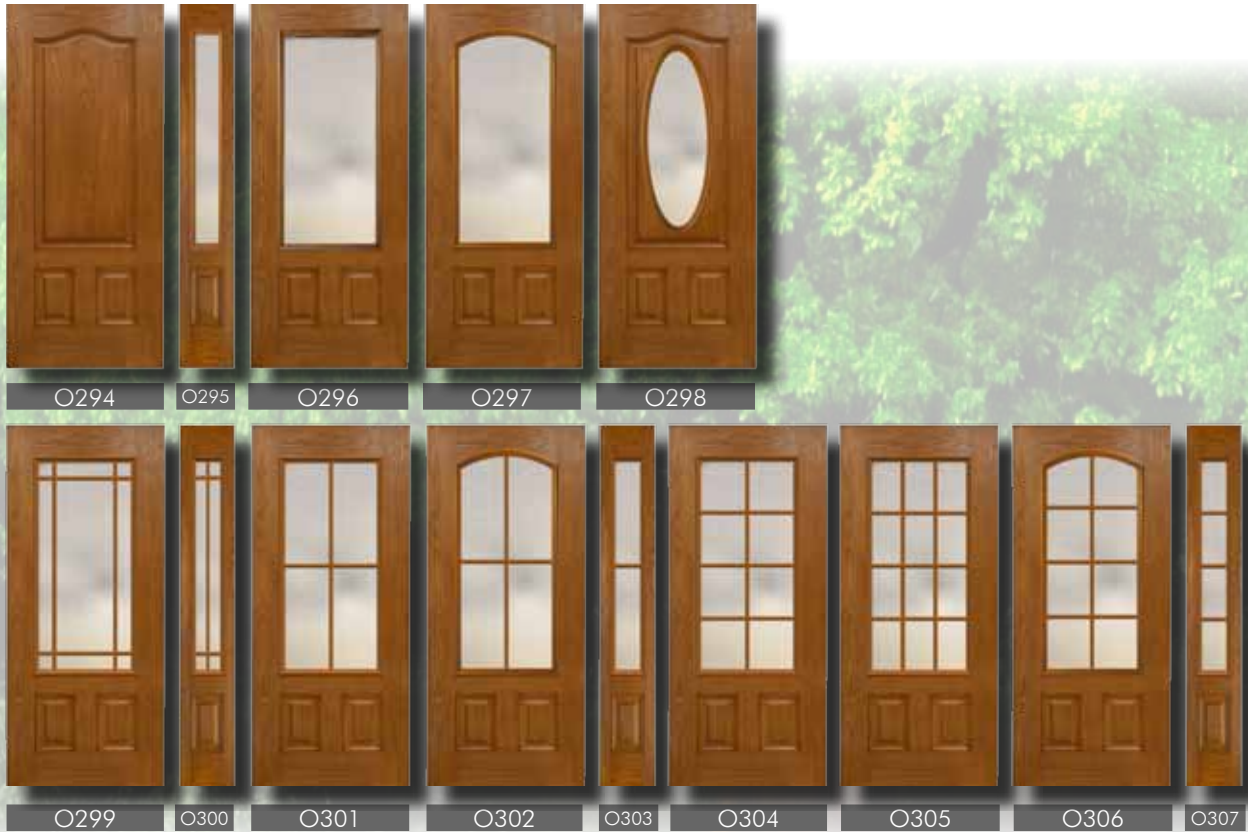
Traditional Oak 6 Panel Entry System