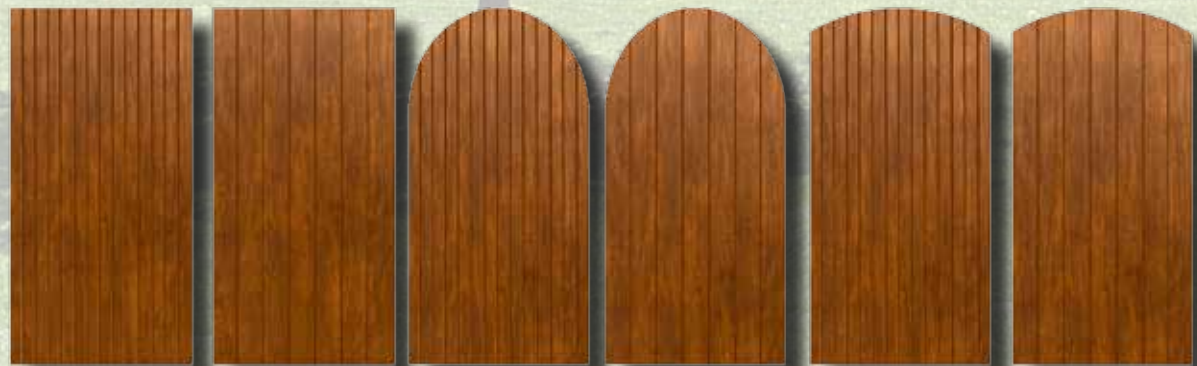
PLANK DOORS 3/6x6/8 &amp; 3/0x7/0