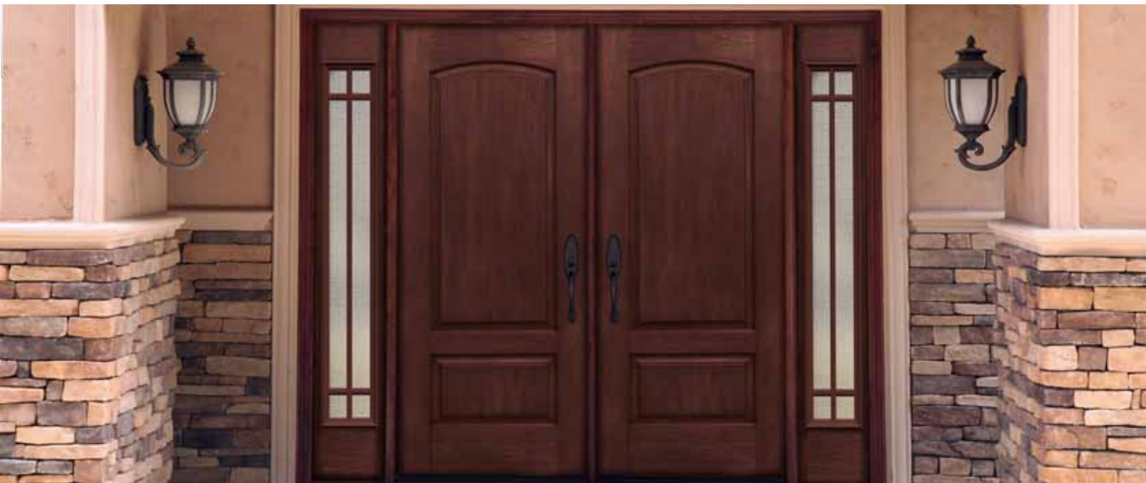
Rustic 2 Panel Cherry Entry System